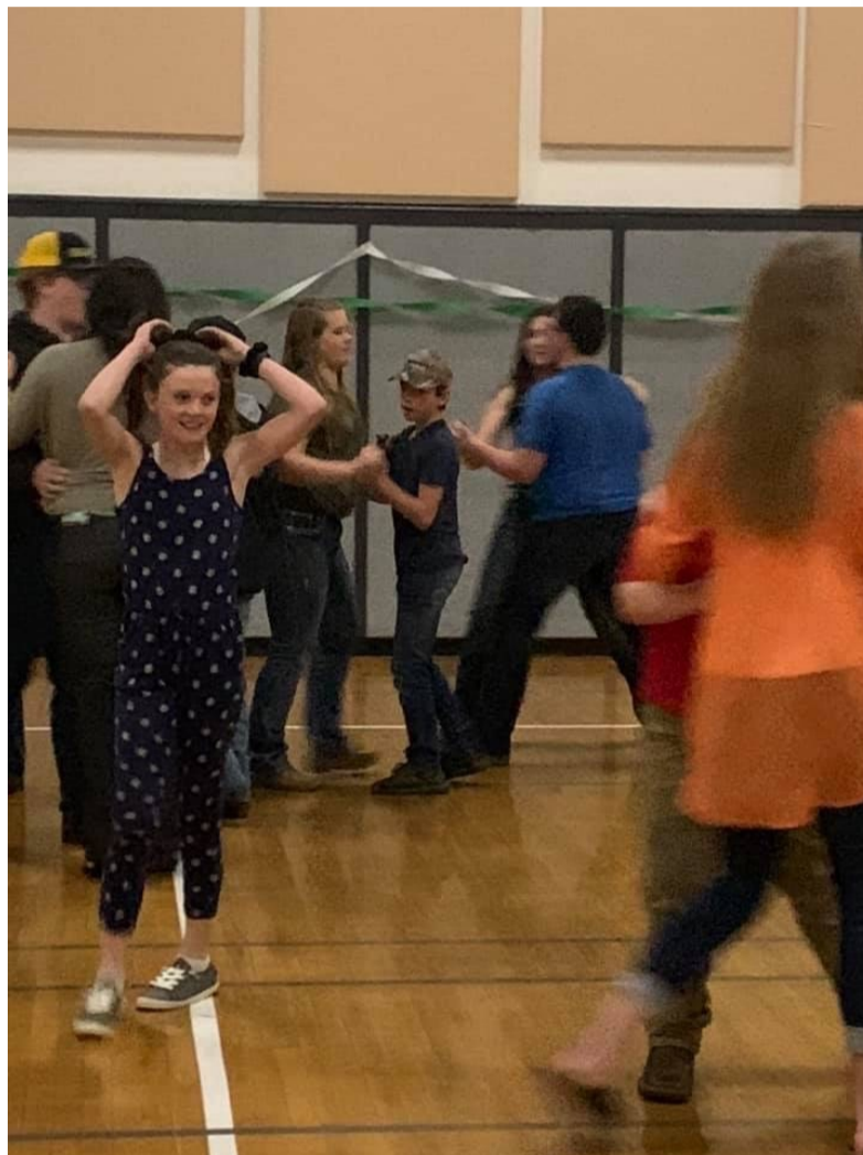
Ring in the 4-H New Year