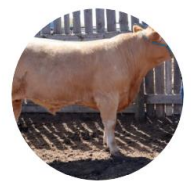
A DAY IN THE LIFE OF A 4-H MEMBER