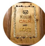
THE TOP 5 THINGS I LIKE ABOUT 4-H AS A CLEAVER KID