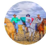
AGRICULTURE AND FOOD PRODUCTION