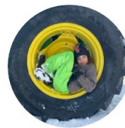
2020/2021 THE BEST IS YET TO COME

Please click here to read the top five stories selected from each category or click on the images shown to go directly to each story. We hope you enjoy reading the inspiring stories as much as we did!