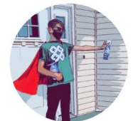
YOU MAY THINK...