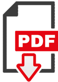
4-H Valentines 2