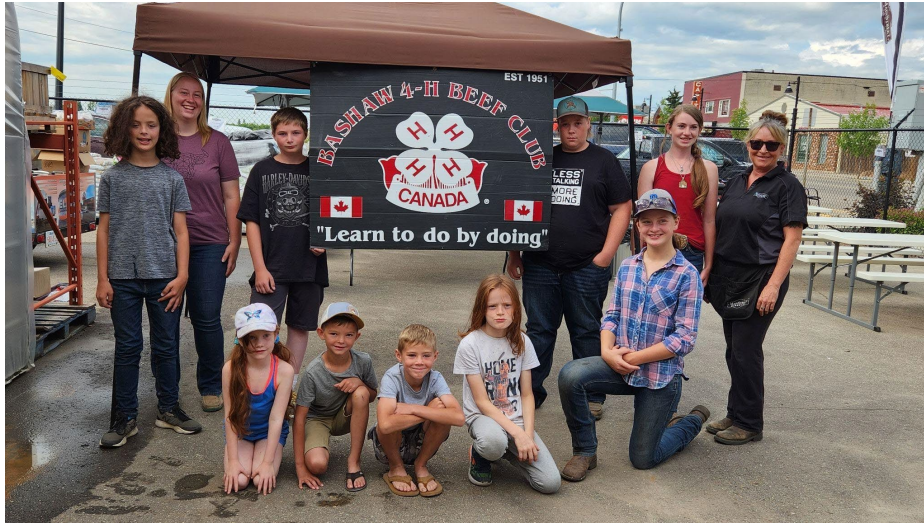
Click image to view/download

In June, Bashaw 4-H Beef Club hosted a BBQ fundraiser in partnership with Mainstreet Hardware (a division of Peavy Mart) in Ponoka.