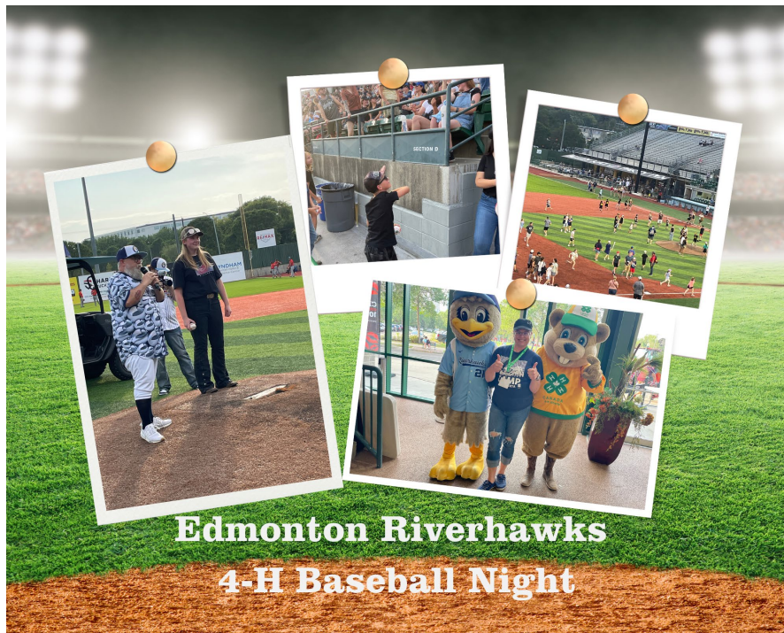
Edmonton Riverhawks 4-H Baseball Night

The Edmonton Riverhawks look forward to hosting another 4-H Baseball Night next season ~ hope to see you all there!