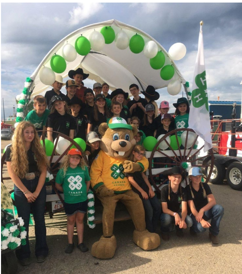
Click image to view/download

Crestomere 4-H Multi Club won their division for their club float in the Ponoka Stampede, June 26 - July 2, 2023.