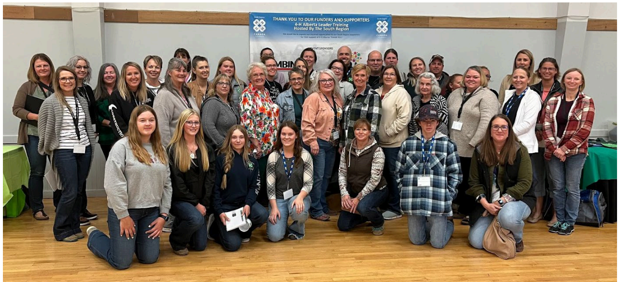
Some of the 75 delegates representing the South, Calgary, West Central and Northwest Regions) attending the 2023 Leader Learning Day in Claresholm, Alberta, hosted by the South Region.