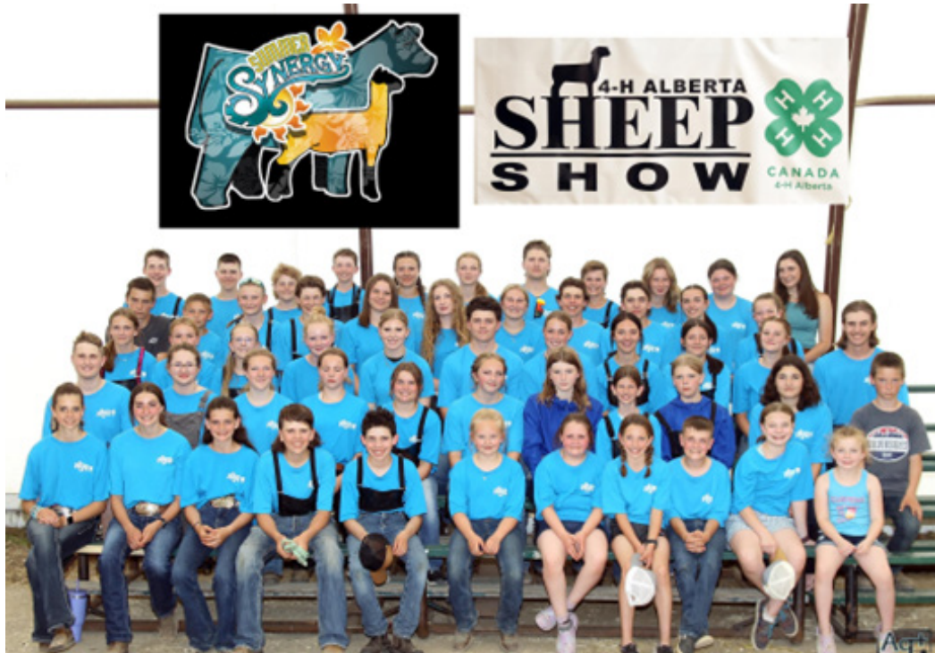
2024 Sheep Show Participants